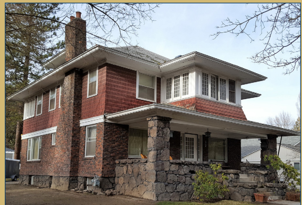
The Toeys House on Bernard on