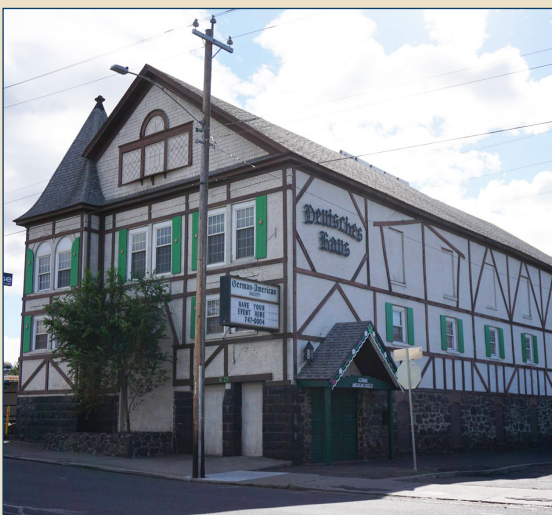
The iconic structure housing the German American Society on Spokane's Lower South Hill

The Spokane Preservation Advocate's committee for the Heritage Fund met and approved a grant to the German American Society in the amount of $3,531.25. Also, a grant for the Historic Warner House of $750 was approved for the nomination to the Spokane Heritage Register.