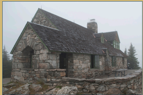
The Vista House at Mount Spokane State Park