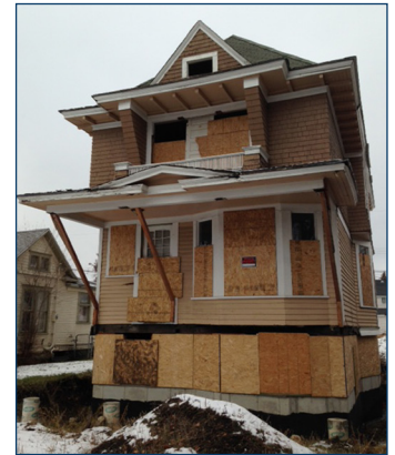
West Central boarded up residence home with an uncertain future