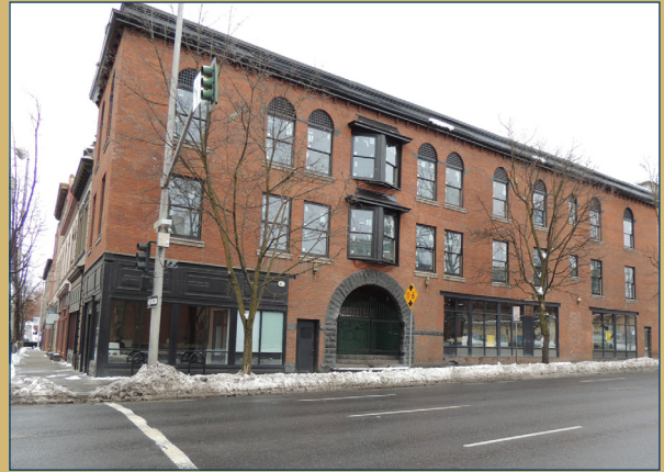
Hotel Aberdeen on Stevens