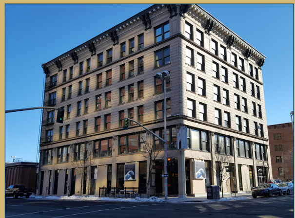
The Columbia Building on Howard