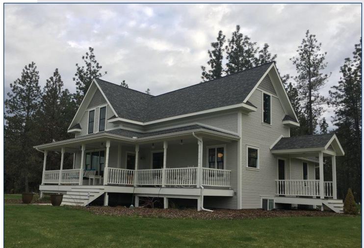
The Folk Victorian-style McAllen Farmhouse