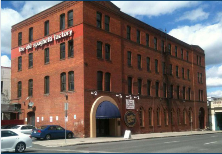
Downtown Spokane's Iconic The Old Spaghetti Factory

with good food, longevity and a rich history.