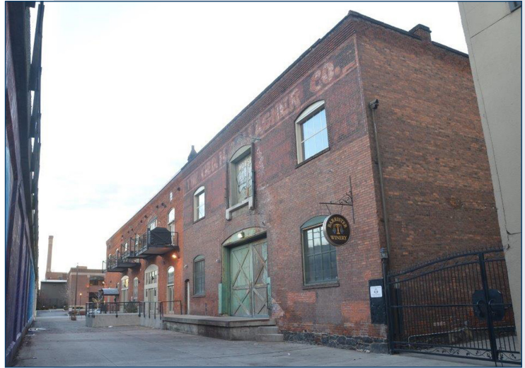
The historic Hobson Building, home of Barrister Winery

The farmhouse was moved from a location on a nearby piece of property in 2005. However, the rural setting is more than likely quite similar to where the house was originally located only a quarter of a mile away.