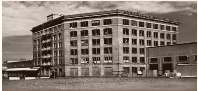
The Historic Jensen-Byrd Building in Spokane's University District