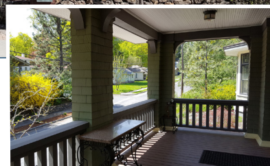
(Inset Photo) The American Foursquare's welcoming front porch overlooking the neighborhood