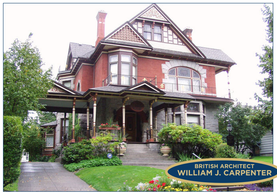
The stunning Loewenberg-Roberts Mansion in Spokane's Browne's Addition

SELF-GUIDED TOURS OF THE E.J. ROBERTS MANSION ARE WELCOME