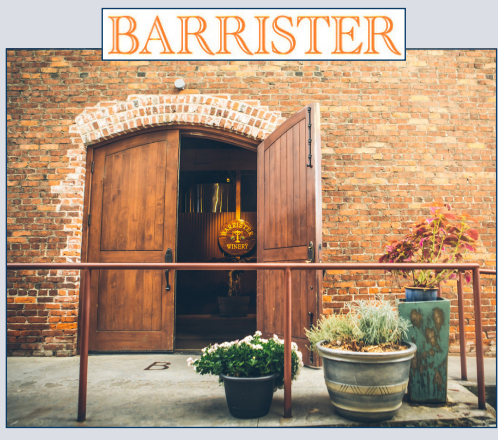
Barrister Winery, the destination for the SPA Annual Benefit