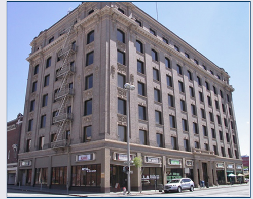
Two iconic historic structures in downtown Spokane, WA ● (Top) The Hutton Building, and (Bottom) the brick Jensen-Byrd Building

OTHER CONCERNS ● On a sadder note, several smaller historic homes were demolished in the name of expansion and progress. The Craftsman homes at 32nd and Grand were demolished with what seemed like lightning speed to make way for a Washington Trust Bank expansion. A turn-