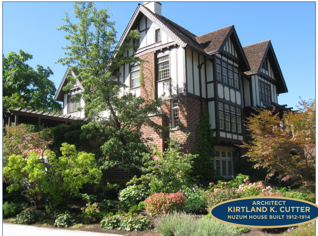
Stunning Nuzum House blossoming in summertime five years ago in Spokane's historic Cliff District

The home is a hallmark example of the Tudor Revival style, which in the late 1890s and early 1900s in Spokane borrowed and "revived" architectural elements and designs from 18th- and 19th-century English and European cottages, row-houses and baronial manor estates.