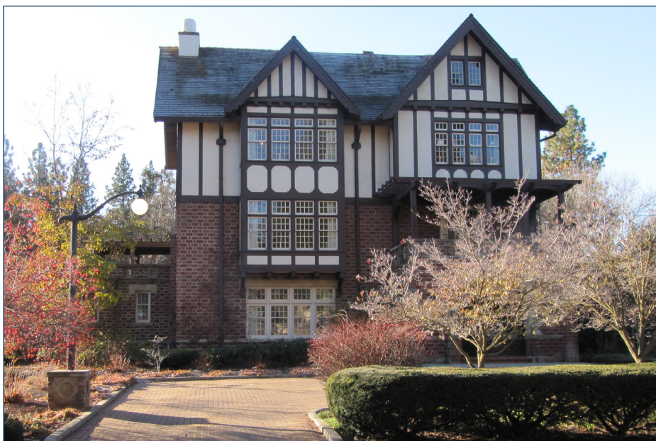
Another view of the of the handsome Tudor-Revival mansion, this time embellished with autumn colors