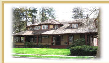
Other preserved historic Browne's Addition "beauties" - The MAC's Campbell House, the Finch House, the Patrick Clark Mansion and the Reid House