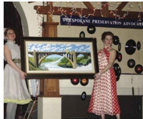
Loud Auction Art Work - Monroe street Bridge.