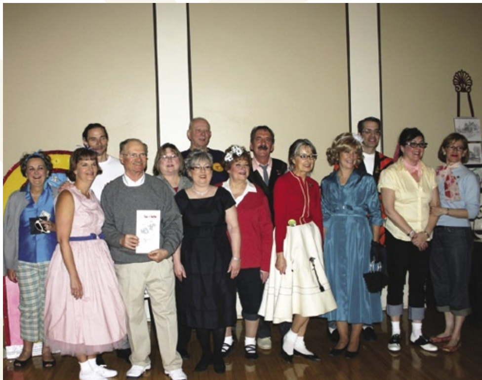
The Gala Committee