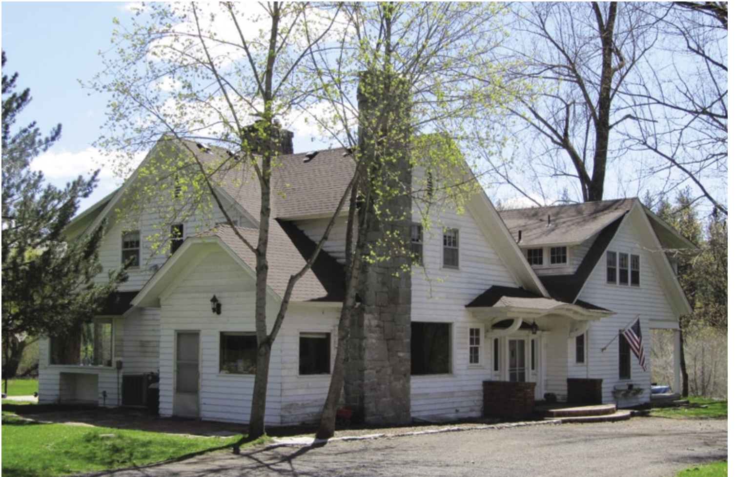
Architect Clarence Smith designed this larger structure for Montvale Farm in 1914.