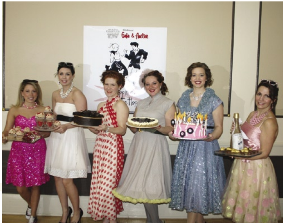
The girls from Finders Keepers doing the Cake Walk.